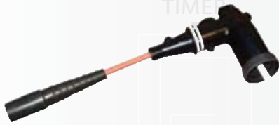
Fitted with 12" of cable and female MC connector