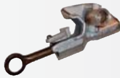
Hot Line clamp Hotstick compatible